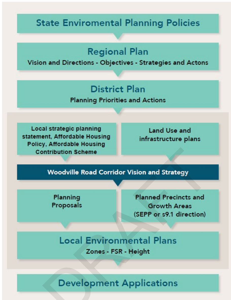
Figure 1: Context of the Affordable Housing Contribution Scheme